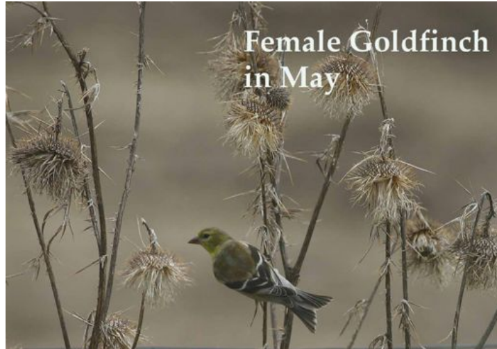
Note the notched tail and conical bill.