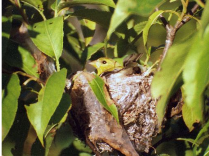
Goldfinches make cup-shaped nests.

Goldfinches nest when fluffy nesting down is available and seeds are plentiful for young birds. This is later in summer than many birds.