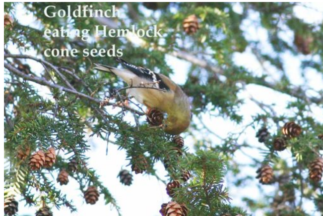
Male Goldfinch Eating Seeds from Hemlock Cone in October